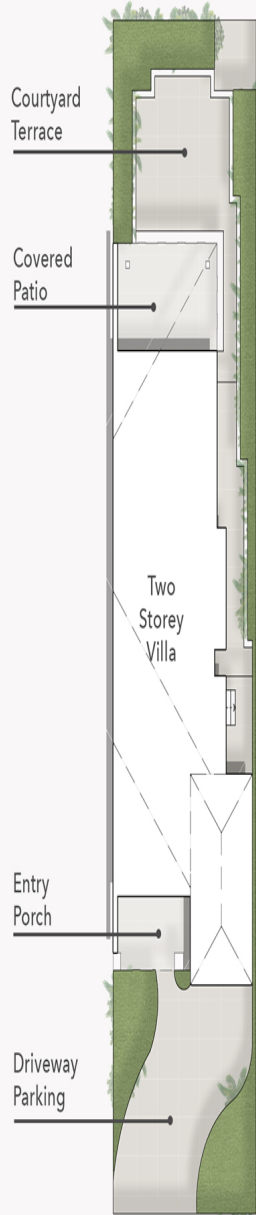
// SITE PLAN