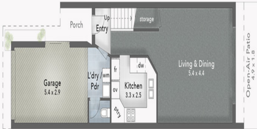
// FLOOR PLAN Ground Floor